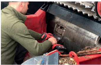
Knives easy accessible when the infeed rollers are hydraulically positioned above the machine