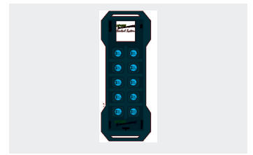
Radio remote control, 2-inch colour display with optional foot control