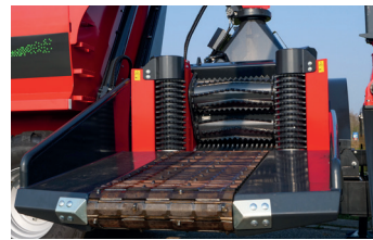
Closed infeed chain optionally