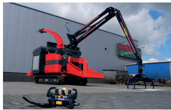
Wood crane optionally