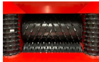
Wide infeed and fitted with standing rollers