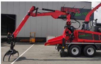
Built on crane Palfinger C45F84 with extra low pillar