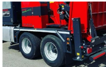
80 km/h axes, supersingle tyres 435 wide