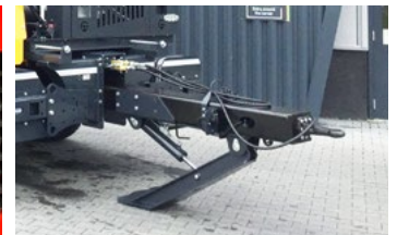
Height and length adjustable drawbar, equipped with hydraulic drop leg