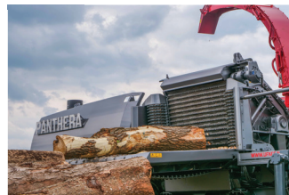
Infeedtable with continuously closed infeedchain up to the infeed