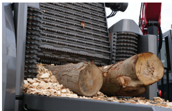
Standing infeed rollers on both sides of the infeed