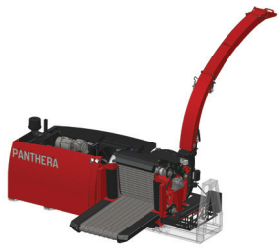
Container chassis (hooklift)