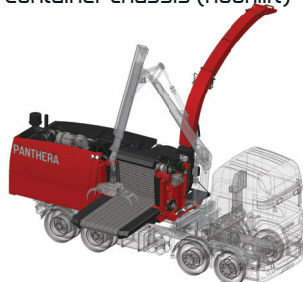
Unit motor mounted