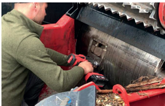
Knives easy accessible when the infeed rollers are hydraulically positioned above the machine