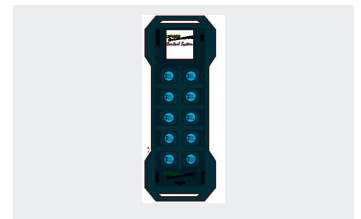
Radio remote control, 2-inch colour display with optional foot control