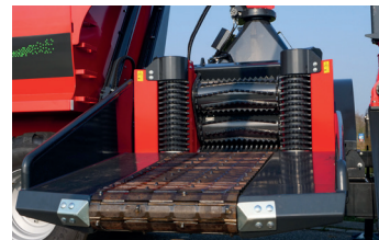
Closed infeed chain optionally