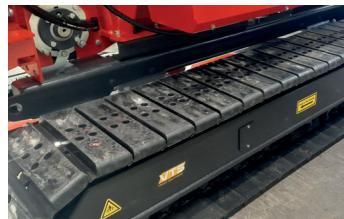
Steel track or rubber on steel